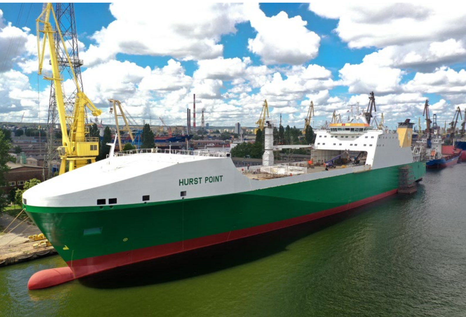
The Hurst Point during intensive work on deck